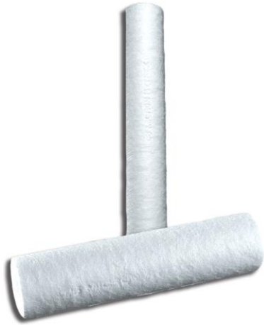
Figure 1: Purtrex Depth Cartridge Filters