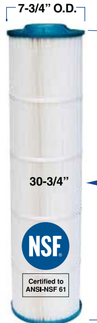
LT2 Cartridge Length and O.D.