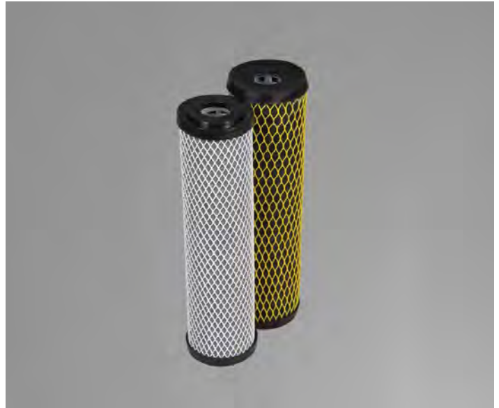
DWCC and DWCF filters reduce chlorine taste, odor, many organic chemicals, oil, and particulates

DWC Series cartridges also provide fine sediment filtration to 5 microns and are available in lengths to 40" and three diameters. Plastisol end caps are standard with optional end fittings available to match a variety of housings.